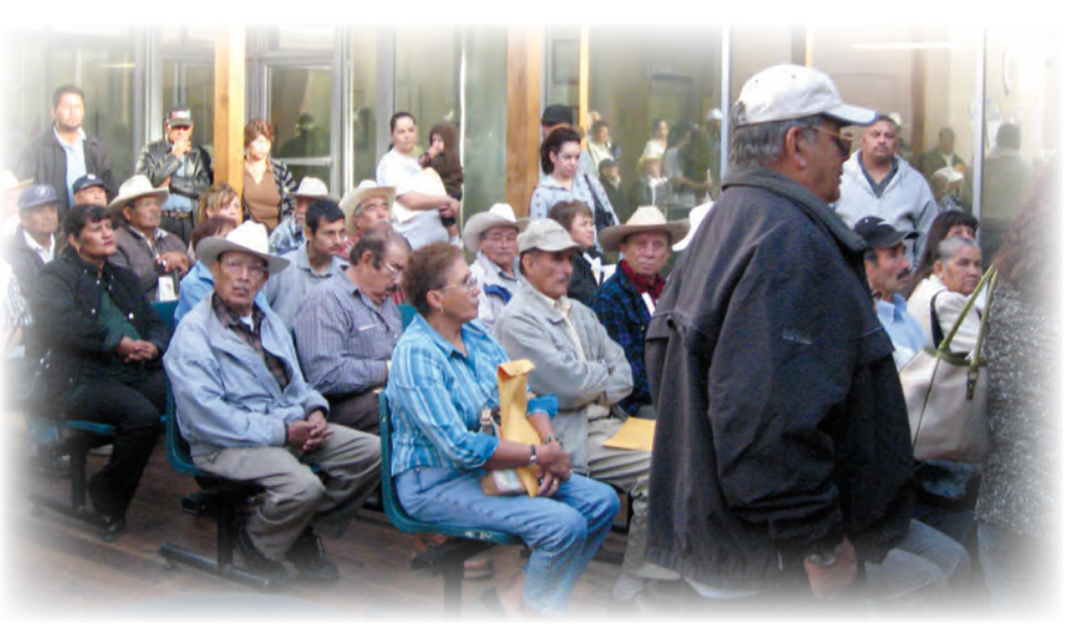
Former braceros at the Mexican consul in Fresno, CA.

Furthermore, in developing immigration policy, AFSC rejects any form of temporary worker program as an alternative to permanent residence. The experiences of past and present guest workers have been characterized by extreme exploitation and abuse akin to human trafficking. Both the infamous Bracero Program and the current H1-B, H-2A, and H-2B programs contain written labor protections. However, the reality is that inspections are inadequate and ineffectual, as the programs