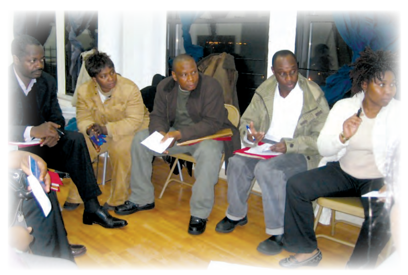
Newark Immigrant Rights Program workshop during 60th anniversary of the Universal Declaration of Human Rights (2008).